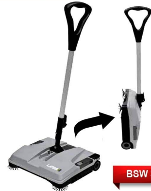
BSW 375 ET