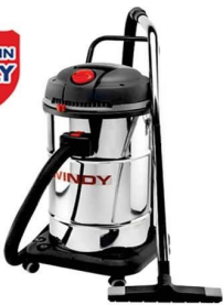
Windy 265 IF Windy 365 IR