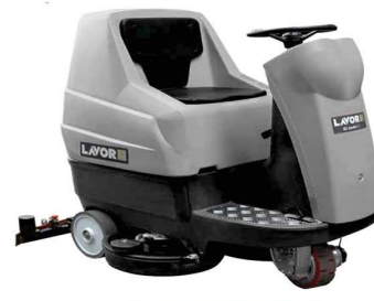
Comfort XS-R Essential