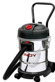
Windy 130 IF