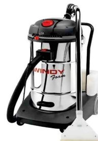
Windy IE Foam