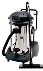
Taurus IR Domus IR