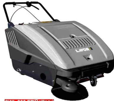
SWL 900 ET (Battery) SWL 900 ST (Benzen)