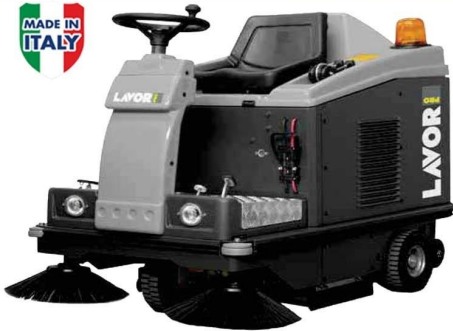
SWL R 1000 ET SWL R 1000 ST